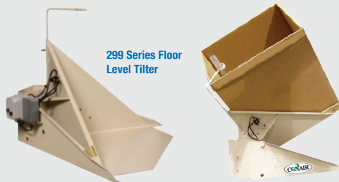
299 Series Floor Level Tilter