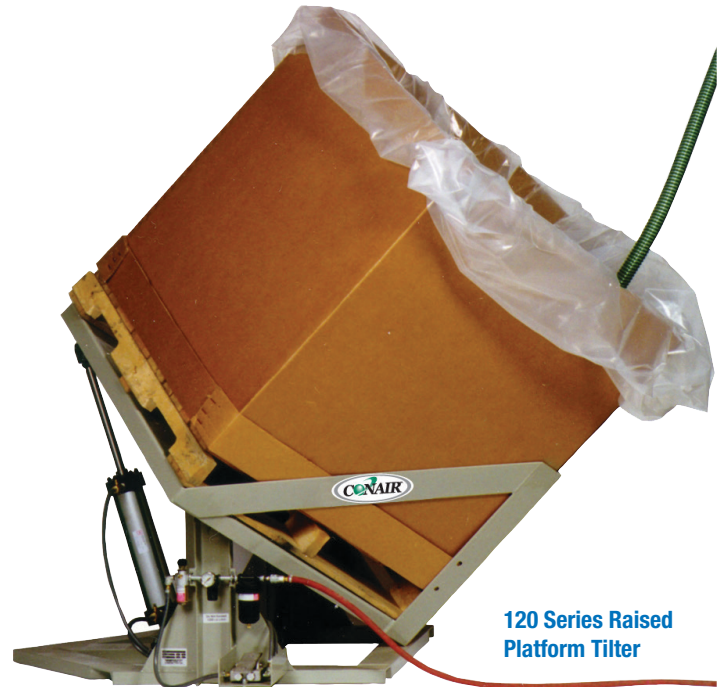
120 Series Raised Platform Tilter

The tilters can be used beside your processing machines or in remote central material storage rooms to assure a constant flow of material throughout your plant. Once emptied, simple foot- or hand-operated controls level the container for removal and replacement.