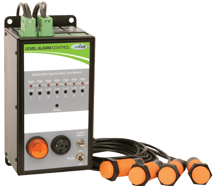
Level Alarm Control Model LAC-1

Individual sensors are available with detachable monitoring cables for use with removable bins. Also, individual sensor switches allow you to change the level alarm to sense high or low material levels.