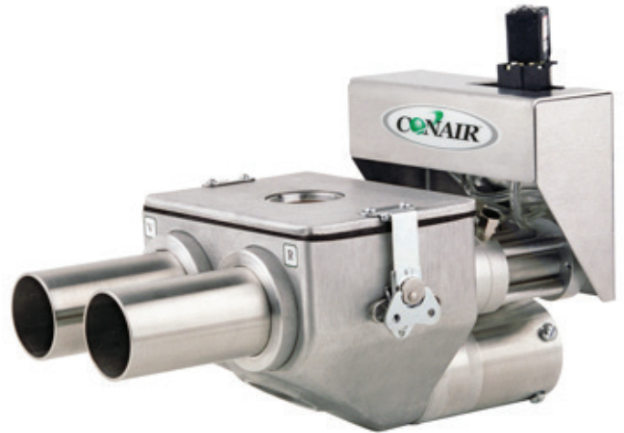
RV-2 Ratio Valve

At rest, the regrind side is open and the virgin inlet is closed, allowing the valve to isolate the receiver from the common material line of central systems.