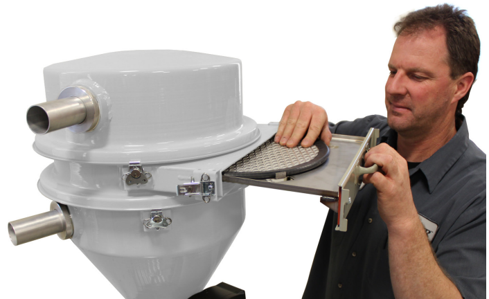
Model FD-15 Filter Drawer on a DL-15 Receiver

This add-on module fits between the lid and body of Conair DuraLoad Receivers and provides easy screen filter access, without the need for lid removal. Tool-free twist clamps hold the drawer in place and once released, allow the drawer to slide out, exposing the screen disc, nested in the drawer cradle. Once checked, cleaned or replaced the screen may be easily slid back into position above the loader body and clamped vacuum tight.