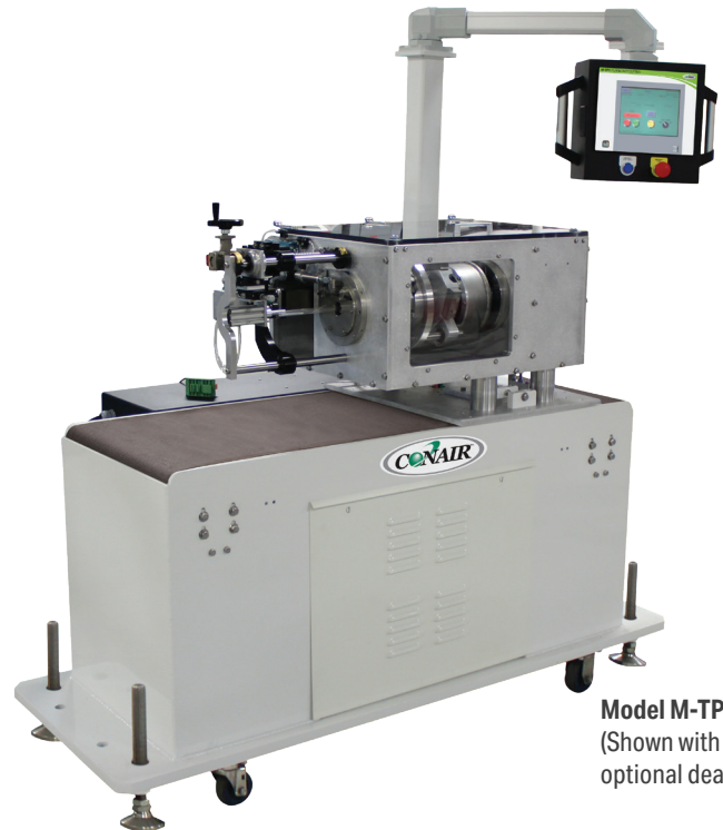
Model M-TPC-1 (Shown with optional dead stop.)

The clamping system and servo table assure quality, planetary cuts. The standard planetary cutter orientation is right-to-left, but left-to-right orientation cutters are available.