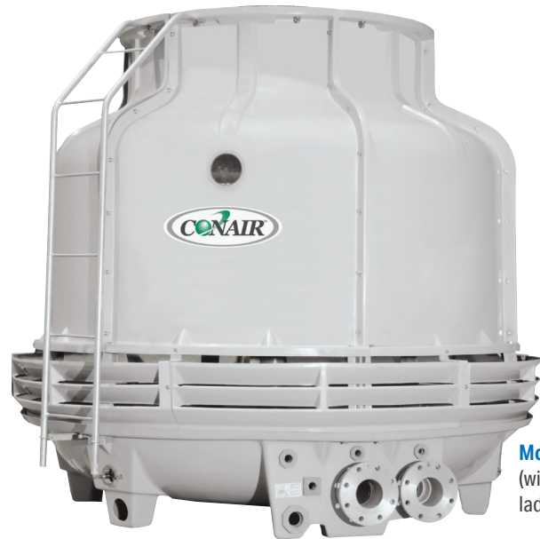
Model E1F-060 (with optional ladder)

Conair's E1F Series induced draft, counterflow towers are rust-proof, not just rust-protected.