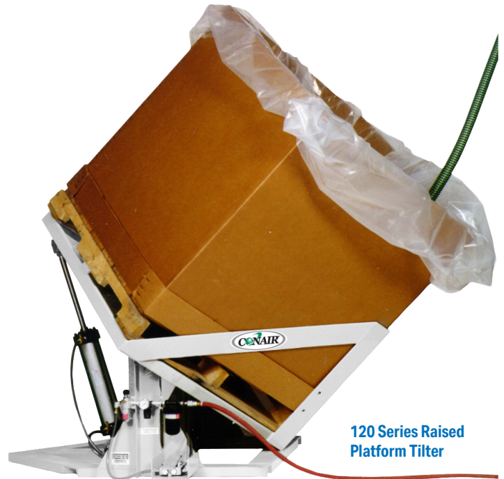
120 Series Raised Platform Tilter

The tilters can be used beside your processing machines or in remote central material storage rooms to assure a constant flow of material throughout your plant. Once emptied, simple foot- or hand-operated controls level the container for removal and replacement.