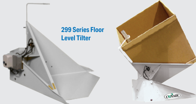
299 Series Floor Level Tilter