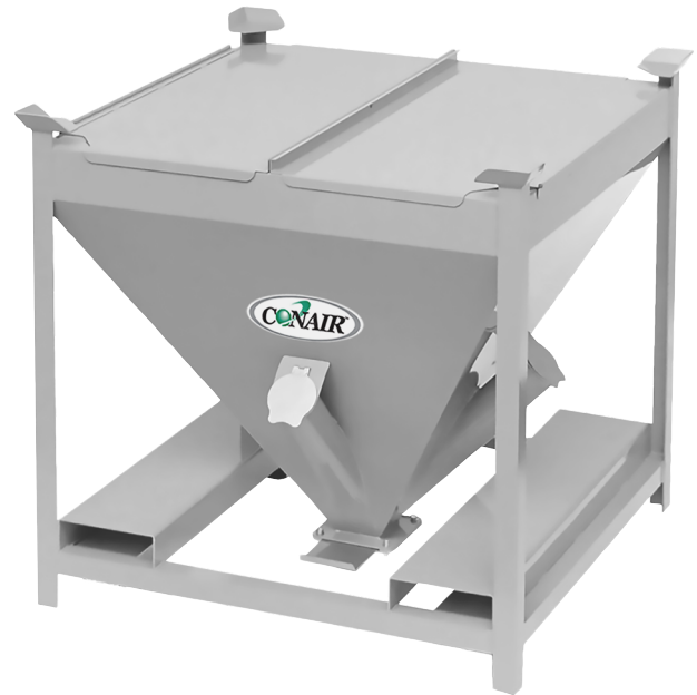
Model MB44-10 Shown with optional two-piece cover, 4-way vacuum ports, and casters.

* Usable volume based on a 30° angle of repose.