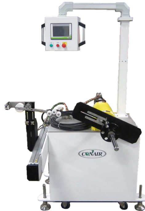
Model MTC (Shown with single spool in MedLine® white.)

The MTC Series are best suited for applications where slower line rates are common and flexible or semi-rigid tubing and profiles need to be coiled.