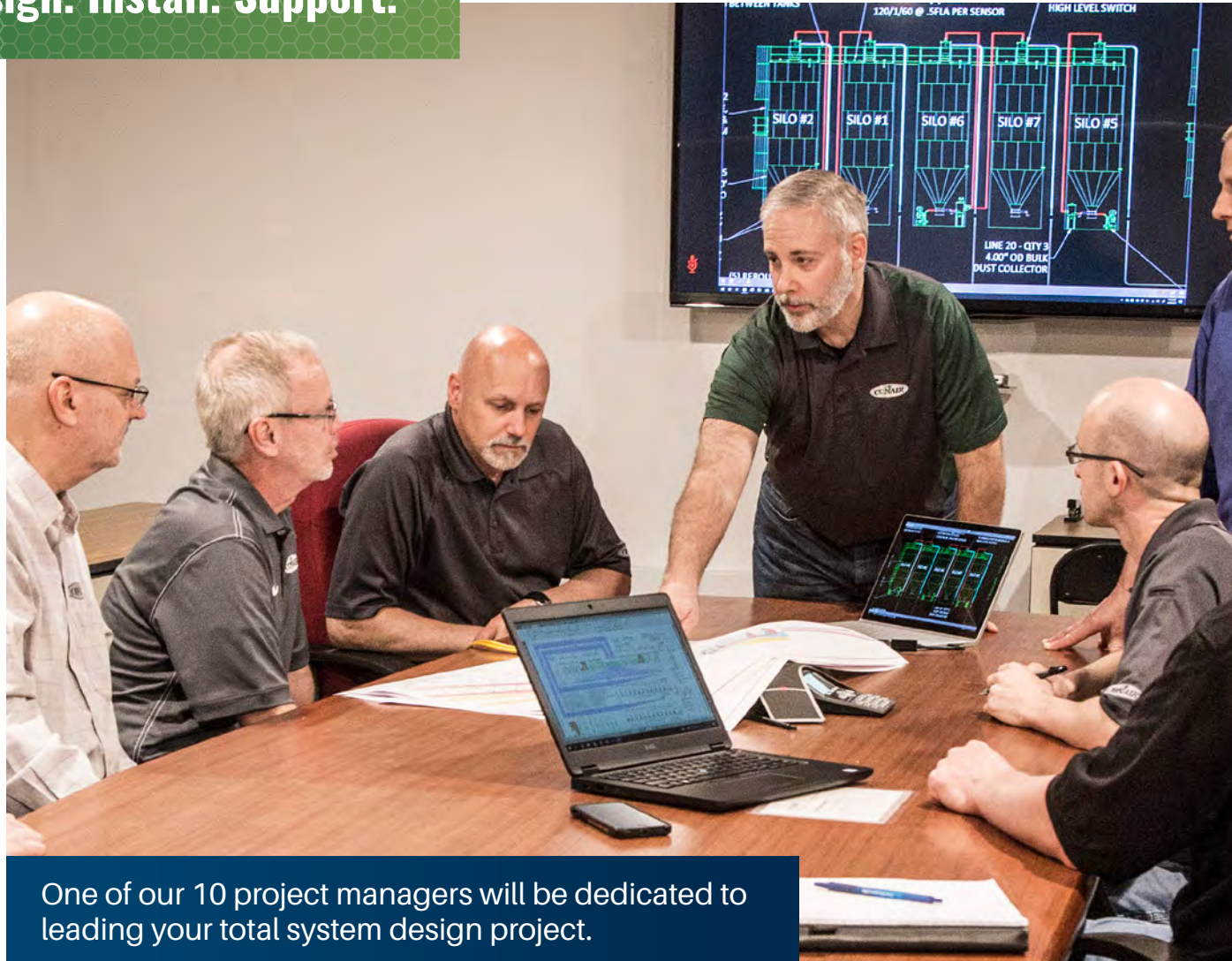
One of our 10 project managers will be dedicated to leading your total system design project.