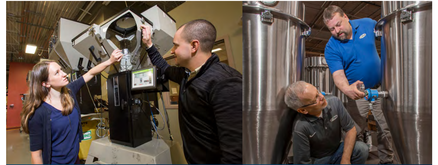
At Conair, we have the experience and technical know-how to get any job done correctly, on-time.

As the leading global supplier of auxiliary equipment and solutions for plastics processors, Conair is a trusted partner when you need it all. You will quickly discover the Conair difference from the time you request a quote, as our project managers become your dedicated single point of contact through every step of the process, ensuring that everything goes exactly as planned. From design, to install, to on-going 24/7/365 support - Conair has you covered.