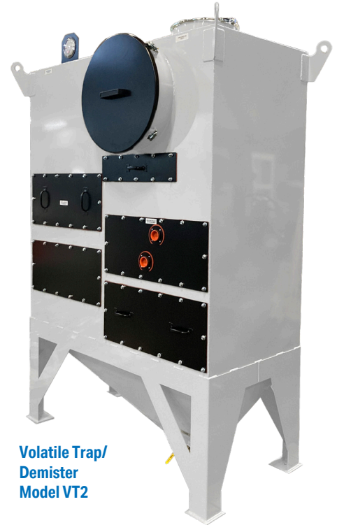
Volatile Trap/ Demister Model VT2

The Volatile Trap is installed on the return line of the drying system and filters out contaminants exiting the drying hopper. The hot return line air is exposed to the Demister cooling coils, and volatiles are expunged from the air and easily drained from the system.