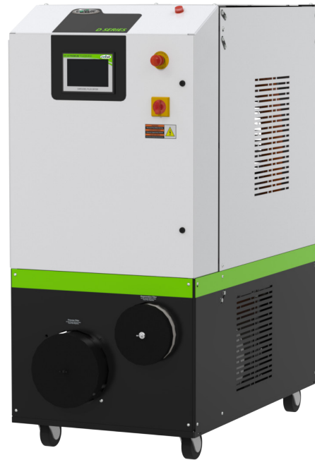
Model D150 Shown with DC-C control

D150 through D400 dryers offer two levels of touchscreen controls, for the simplest, yet most sophisticated control over the drying of your valuable resin.