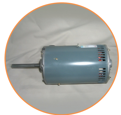
Condenser Fan Motor