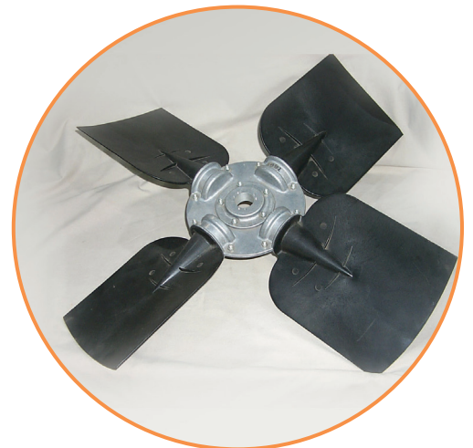
Condenser Fan Blade