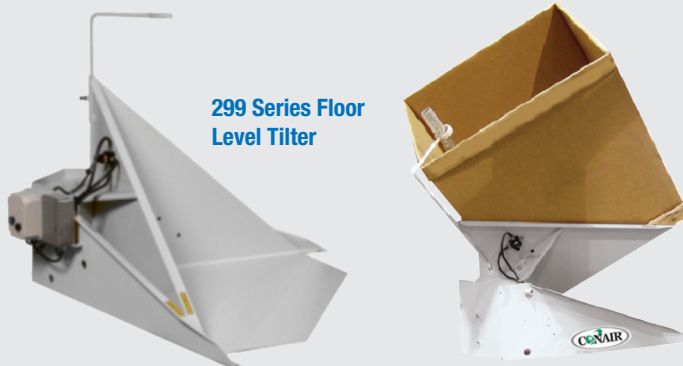
299 Series Floor Level Tilter