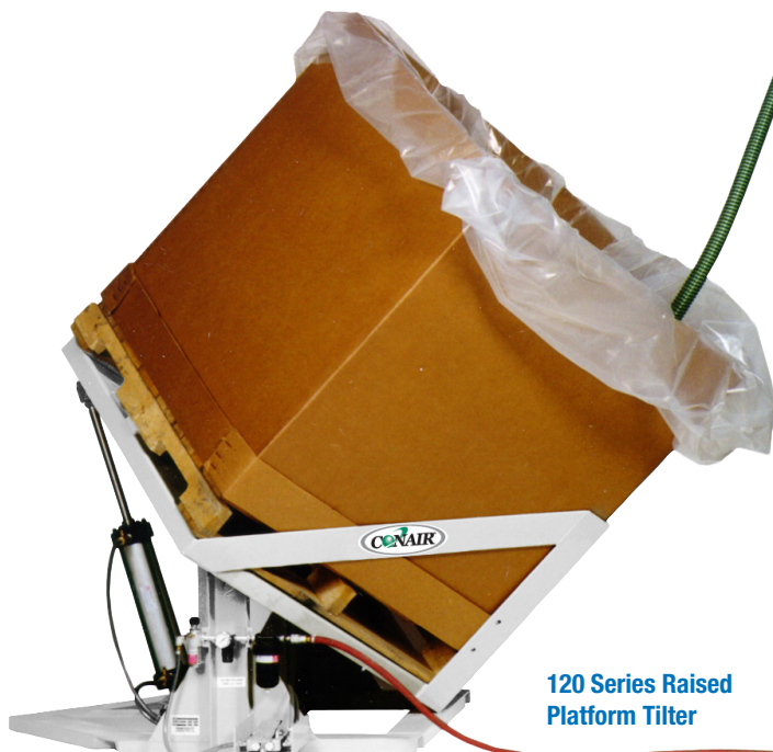
120 Series Raised Platform Tilter

The tilters can be used beside your processing machines or in remote central material storage rooms to assure a constant flow of material throughout your plant. Once emptied, simple foot- or hand-operated controls level the container for removal and replacement.